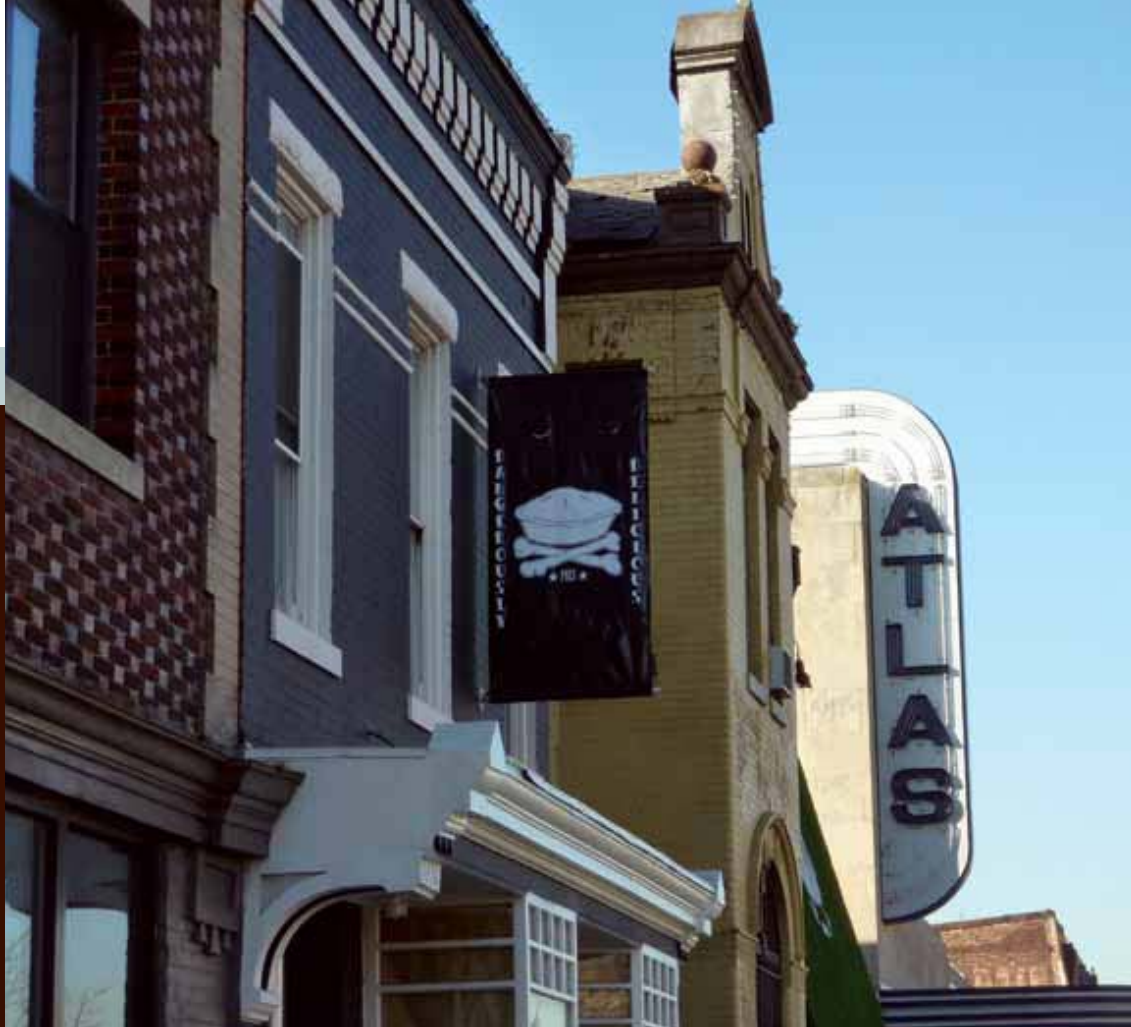
The Atlas Performing Arts Center and the H Street Playhouse form the cultural heart of H Street, NE