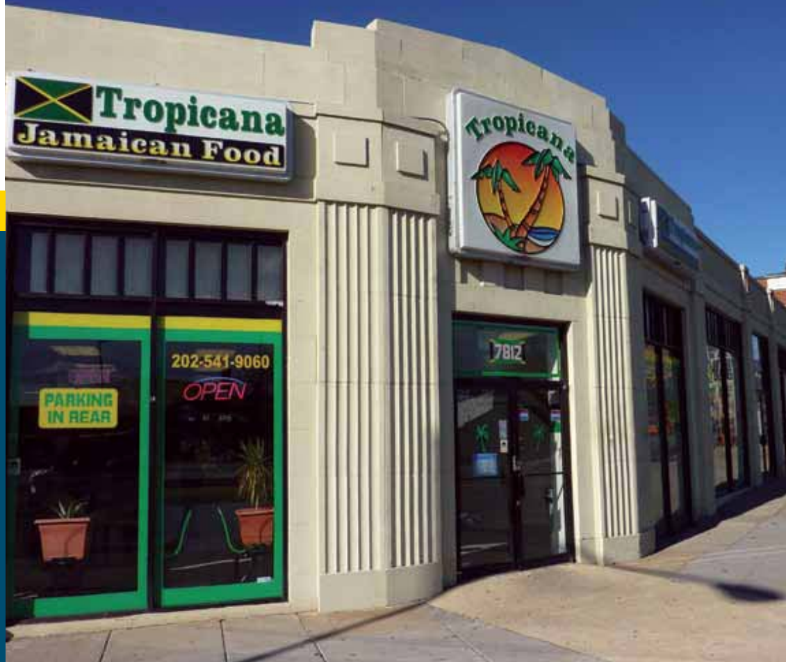
Gateway Georgia Avenue features new storefronts, landscaped public spaces, red brick sidewalks and globe lampposts

A bustling community of independently owned boutiques, restaurants and professional services, Gateway Georgia Avenue welcomes approximately 27,500 commuters by car every day and serves as a hub linking several nearby neighborhoods.